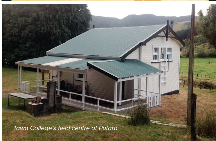
Tawa College's field centre at Putara