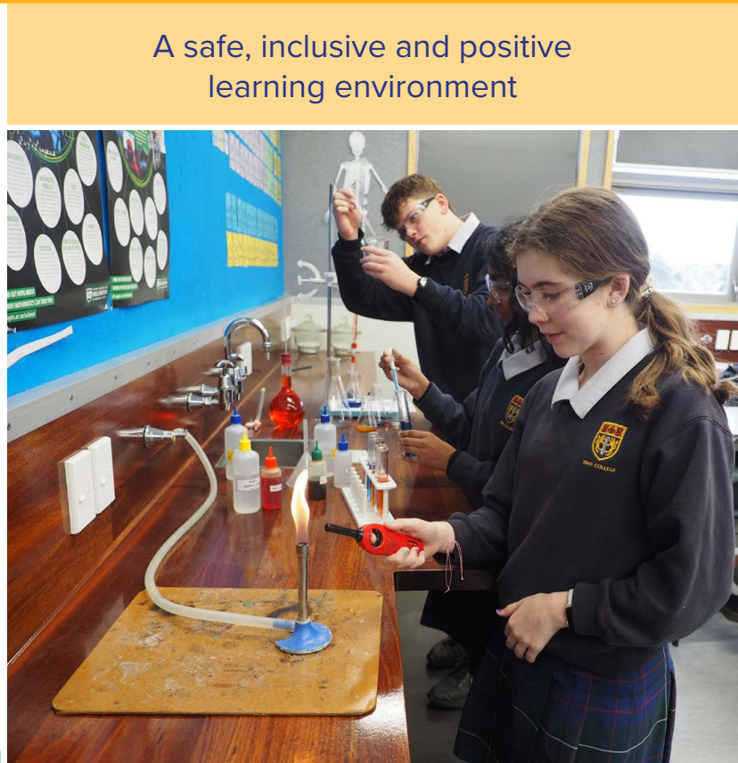
A safe, inclusive and positive learning environment