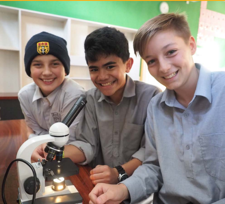
High standards of attainment and participation