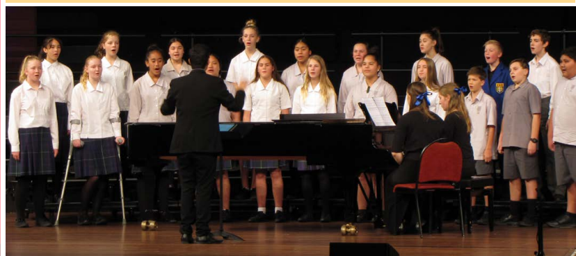
Community and whānau support